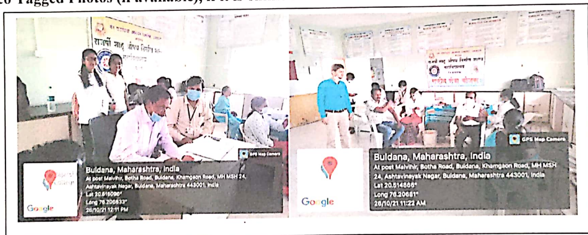
Vaccination Camp@RSCP, Buldana

Geo Tagged Photos (if available), if it is online then add screenshots: